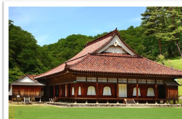
旧閑谷学校(Former Shizutani School)