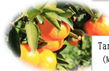
Tangerine picking (Middle October~Early December)