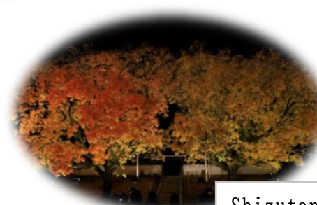
Shizutani illumination (Around November)