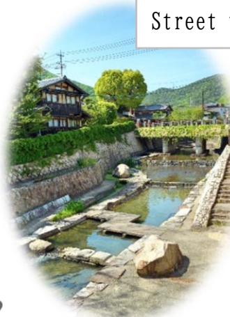
Street view of Inbe